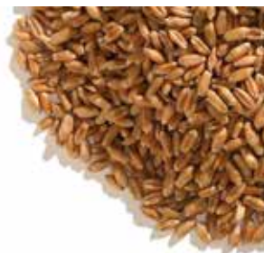
Protected with Diacon®-D IGR