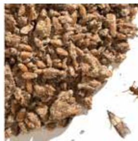
Unprotected wheat after 150 days of insect infestation*