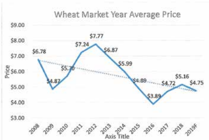
Source: https://quickstats.nass.usda.gov/ , *(P)= projected value by USDA