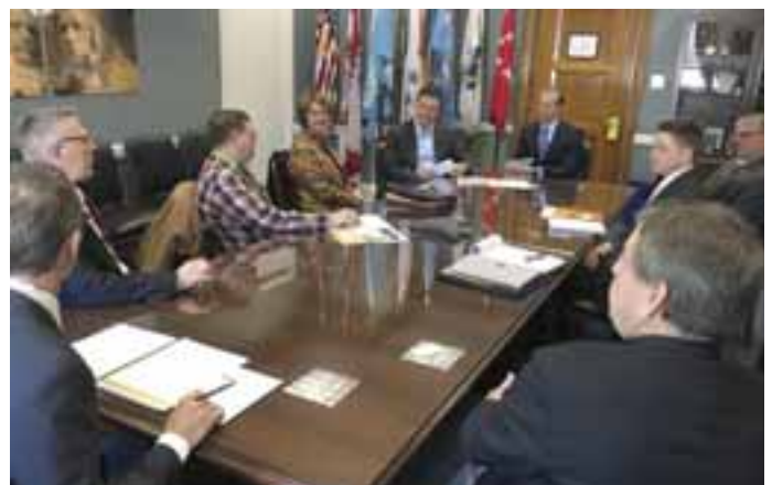
SD Wheat Inc., Board of Directors sharing their message with Senator John Thune.